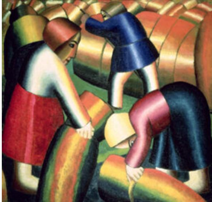
Taking in the Rye (1912) Kazimir Seveinovich Malevich (Ukrainian)