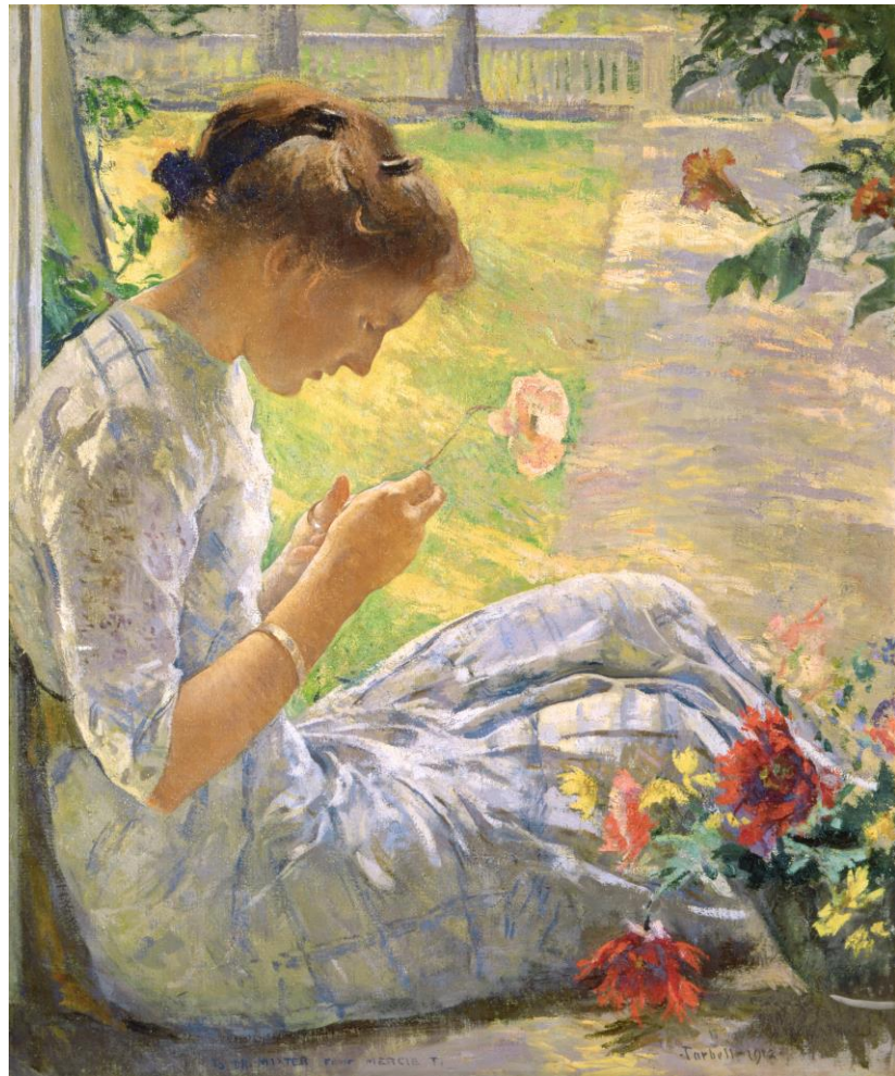
Mercie Cutting Flowers (1912) Edmund Charles Tarbell