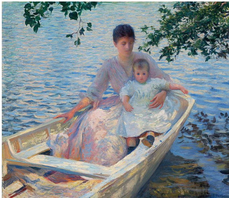
Mother and Child in a Boat (1829) Edmund Charles Tarbell