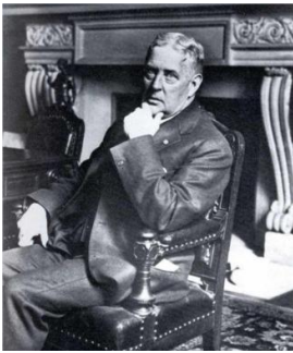
Edmund C. Tarbell

Note: Click on the text below any image to locate a vendor for that image. Some of these selections may be available in the gallery pre-framed.