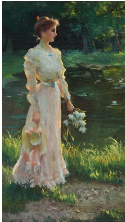
By the Lily Pond (1908) Charles Courtney Curran (American)