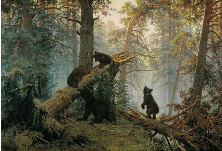
Morning in a Pine Forest (1886)