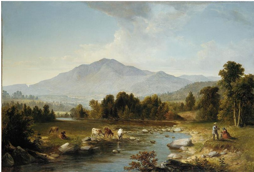
High Point: Shandaken Mountains (1853)

Prints are special order only. Contact the gallery for details.