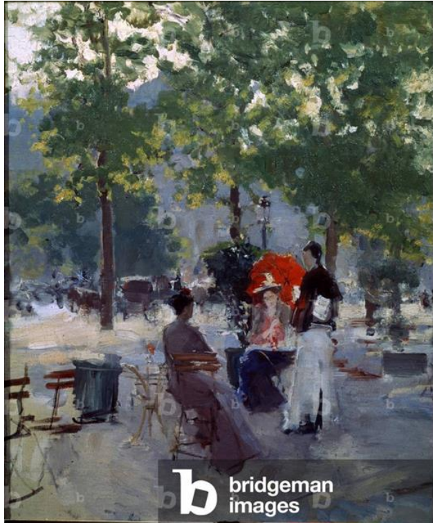
Café at Paris 1890