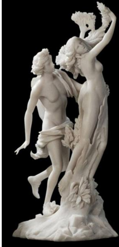
Apollo and Daphne Gian Lorenzo Bernini Galleria Borghese, Rome, Italy