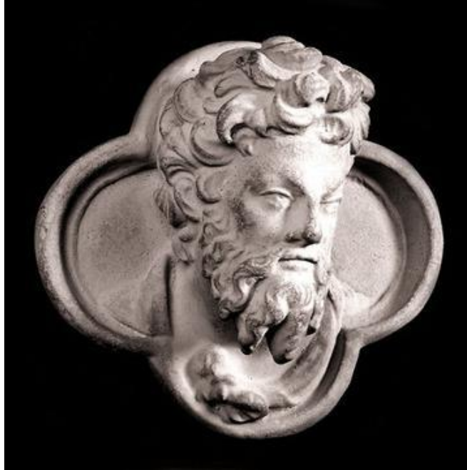
Detail from Bronze Gate Lorenzo Ghiberti