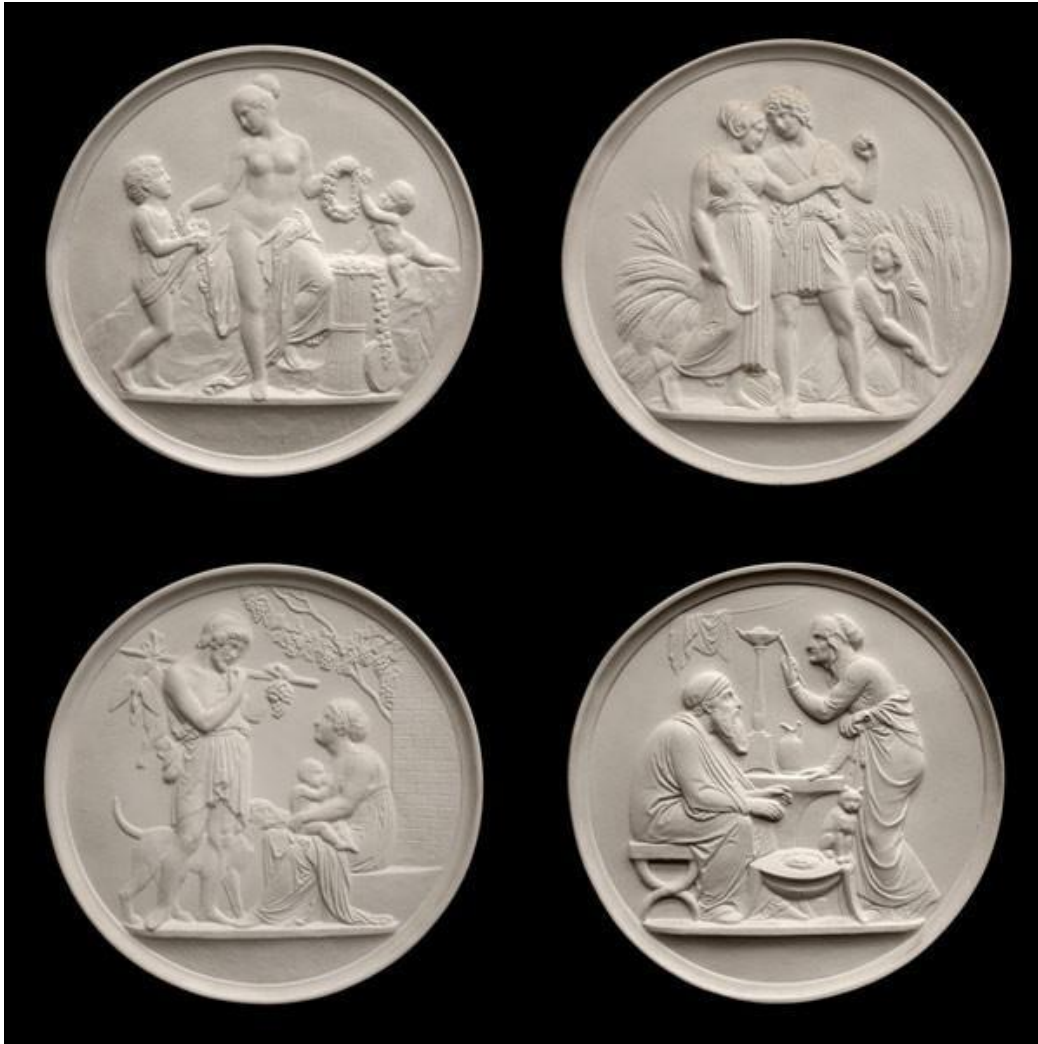
The Four Seasons (1836) Bertel Thorvaldsen Thorvaldsen Museum, Copenhagen, Denmark