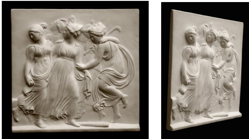
The Muses (1804)

The Parkville Frame Gallery has years of experience framing a variety of things. For example: wedding dresses, military medals, family photographs, sports memorabilia, fine art prints, and much more. The Sculpture Series introduces a collection of sculpture reproductions that we can also make available to our customers. These, and other sculpture reproductions can be purchased either as stand-alone pieces, or framed to your specifications. Let's create something together.